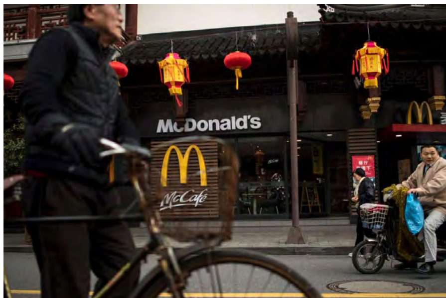
McDonald's in Shanghai

KFC, an American company born in the 1940s and 1950s in Kentucky,