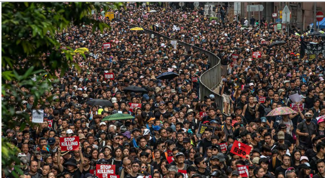
Thousands into the streets against the extradition law