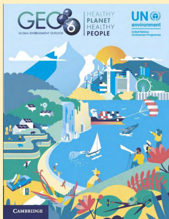
Global Environment Outlook 6 (GEO-6) published by the UN in July 2019 denouncing the imminent environmental catastrophe

This acceleration of climate change is undoubtedly because of human action. And although there are discrepancies in the magnitude of the effects and in the times in which they will take place, it is