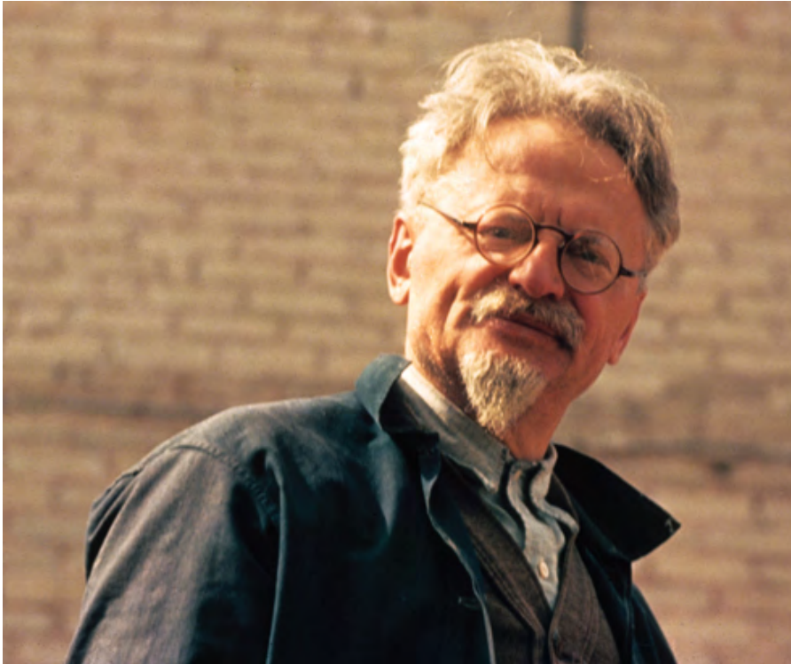
Despite the bureaucracy of the Cuban CP, they cannot ignore Leon Trotsky