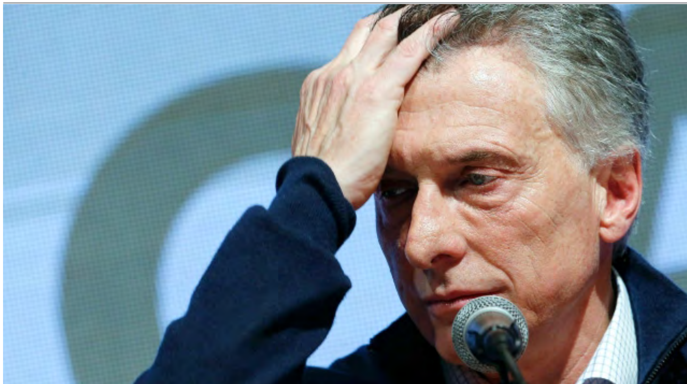
Macri, the day after the election