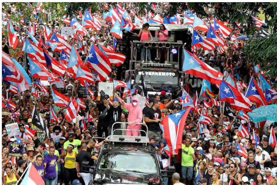
The mobilisation of hundreds of thousands of Puerto Ricans drove out the corrupt governor Rossello

Since 1950, two parties have alternated in power in Puerto Rico,