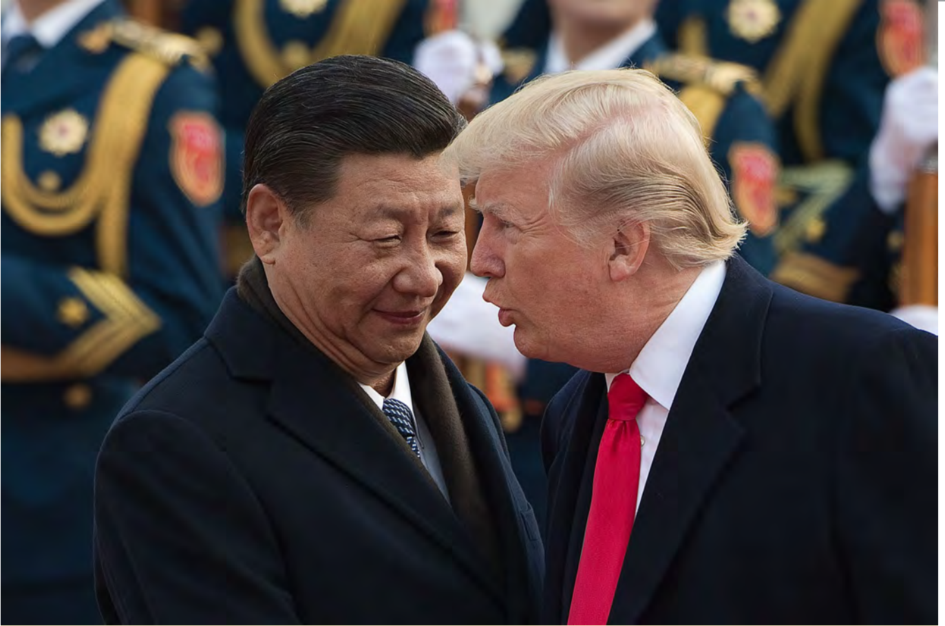
Xi Jinping and Donald Trump at the G20 meeting in Japan, June 2019

universities, including a Harvard branch, in China.