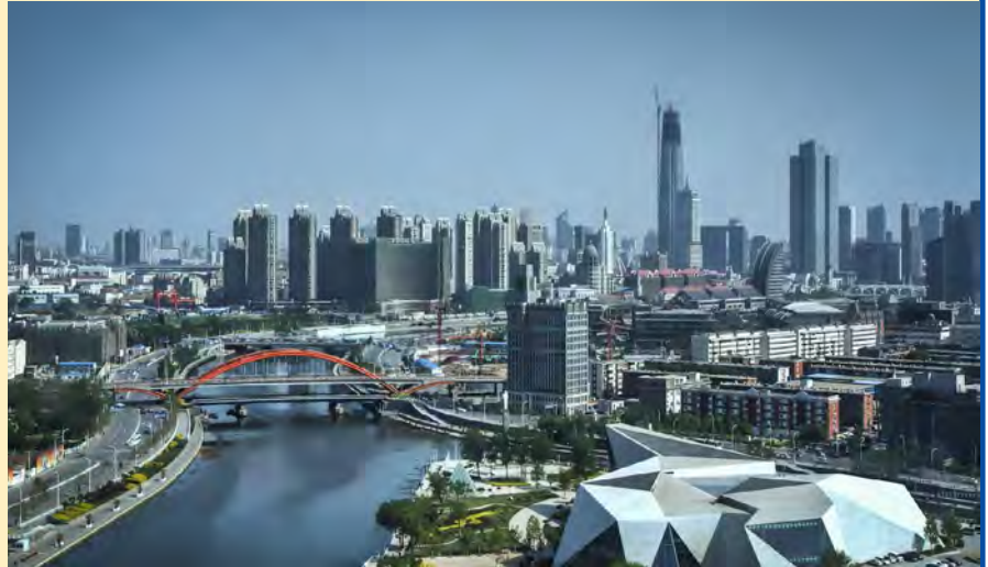
Tianjin, the port of Beijing