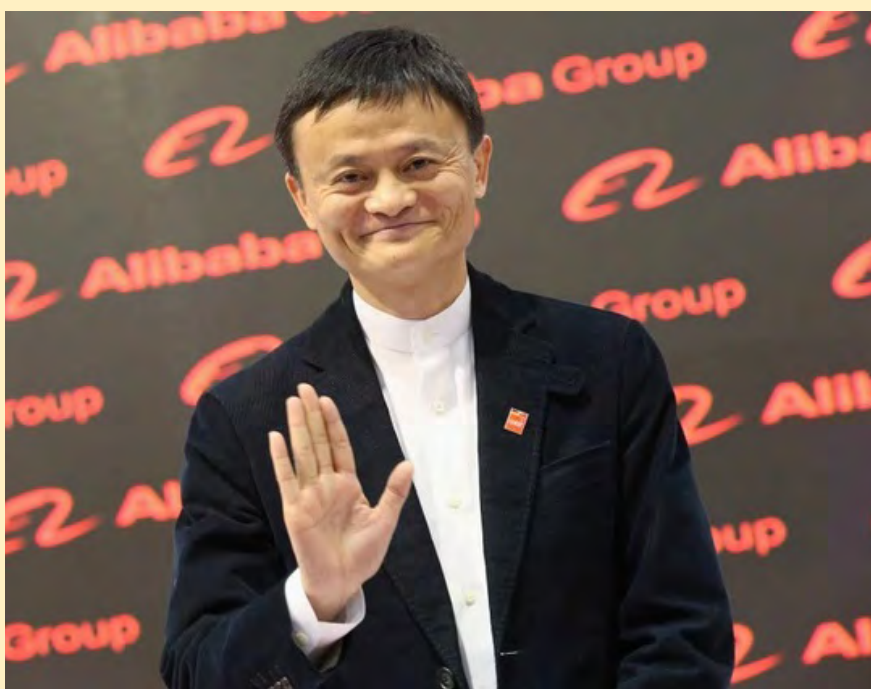
Jack Ma, Alibaba co-founder

7. Wang Wei: presides over SF Holding, a parcel delivery service