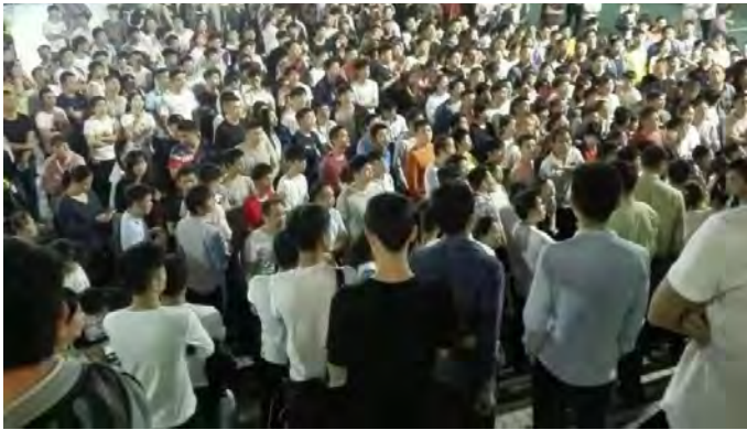
Biel Crystal workers, in Huizhou, gathered in protest for wage delays and layoffs