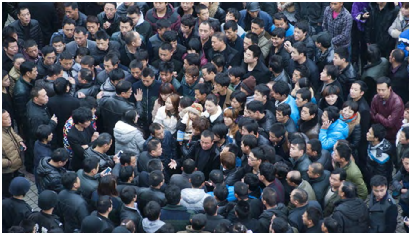
Thousands of Longmay Mining workers protest over unpaid wages

miracle” has always been talked about as a demonstration of the progress that capitalism can give. There was a factor that was the unprecedented invasion of foreign investments in the last 20–30 years. But the “Chinese miracle” is based on the over-exploitation of millions of workers with salaries in dollars 30 or 40 times lower than those in the metropolises. This has allowed a capitalist accumulation, enrichment, and a spectacular profit of the multinationals and the new Chinese bourgeoisie itself that was emerging in the heat of openness to capitalism.