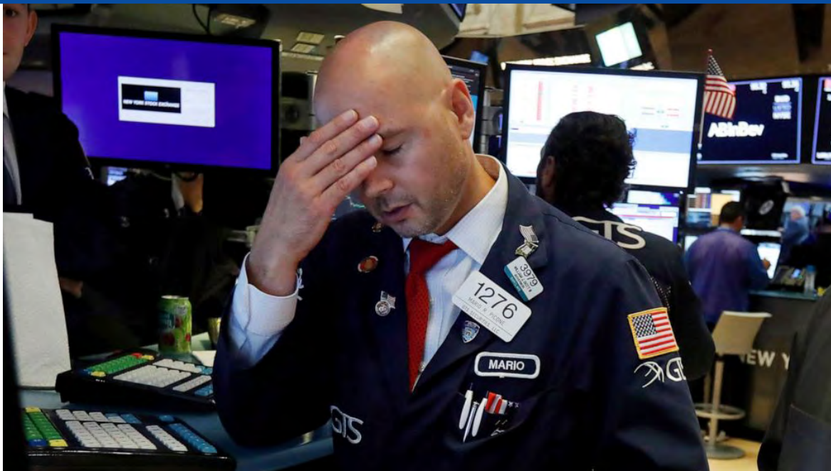
Collapse in Wall Street