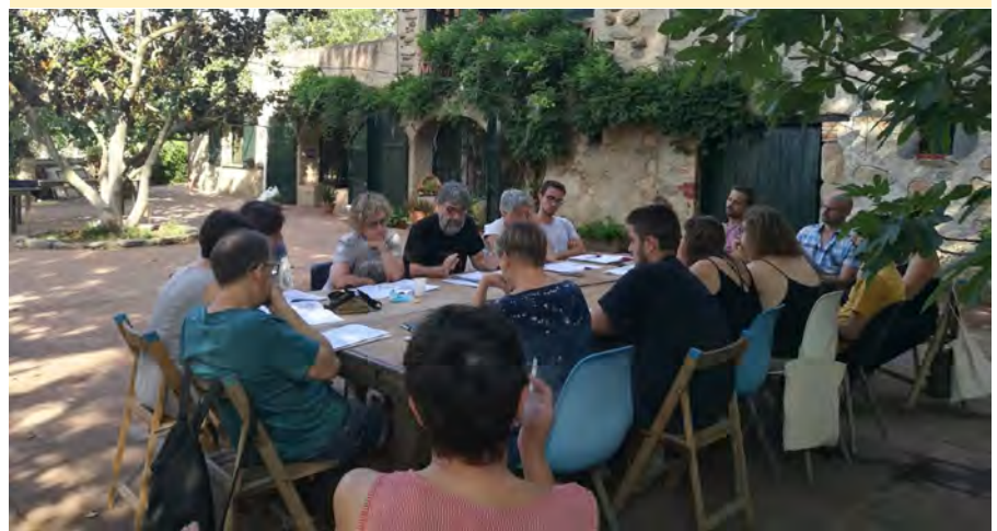
Study table in Barcelona

Debates in the left on the national question. The first day of the session was in the city of Barcelona and the others in a nearby summer camp. At