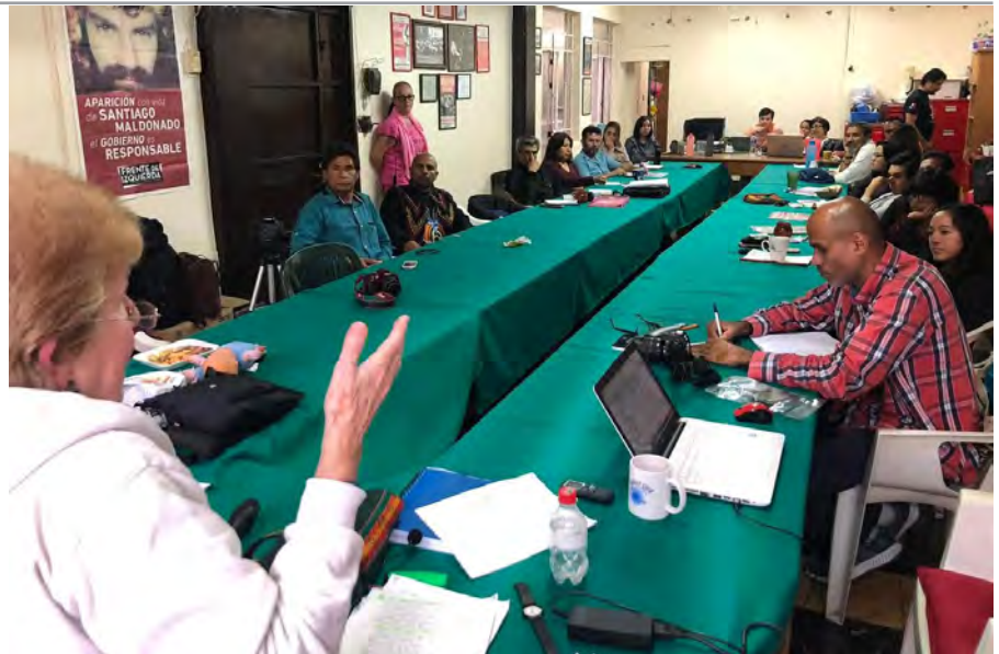
Debate in Mexico

On 1, 2, 3 and 4 August, was held the summer school organised by Lucha Internacionalista (Internationalist Fight), Spanish State section of IWU-FI. This time the chosen theme was: