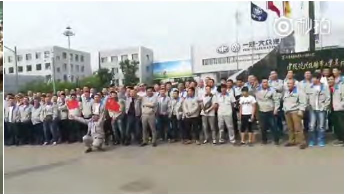
Protest at the Faw-Volkswagen plant in Changchun

Workers and social struggles grow in China, despite repression and censorship applied by the Chinese dictatorship. To show this, it will be worth reading this article published in The New York Times that we reproduce for the most part.