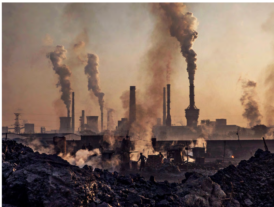
Pollution created on the factories of Chinese capitalism

The dominant ideology tells us the fight against climate change is a "struggle of humanity" against a phenomenon "humanity" provoked. This is a half-truth that hides the most important thing: "humanity" is divided into classes, and the world capitalist ruling class commanded by its big multinationals is the one that dominates the economy and constantly advances rapaciously over nature regardless of the environmental effects. No individual capitalist, no group of capitalists, can or will solve it, and if