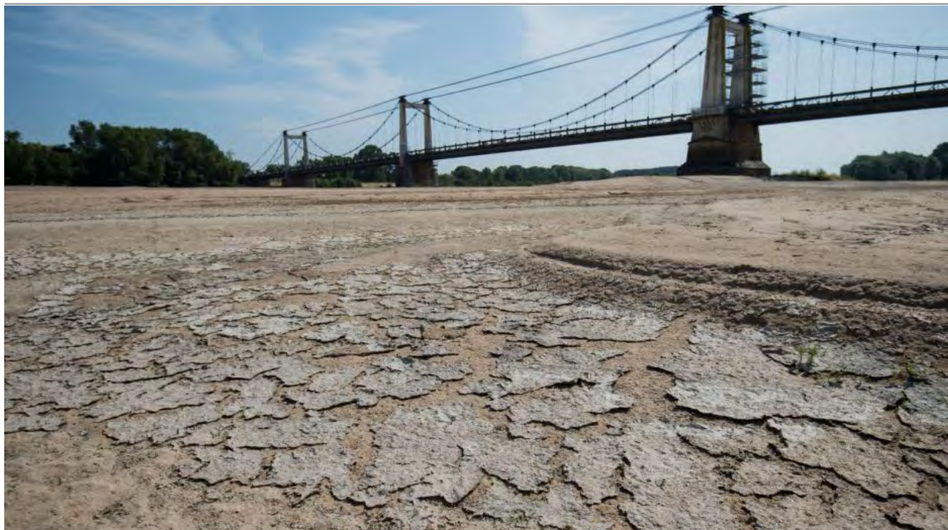
Dry bed of the Loire River in France