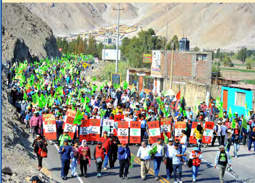
Demonstration in Tambo Valley, Islay, Arequipa

Peru is one country with the most intense struggles to defend the environment from multinational capitalist depredation, especially mining.