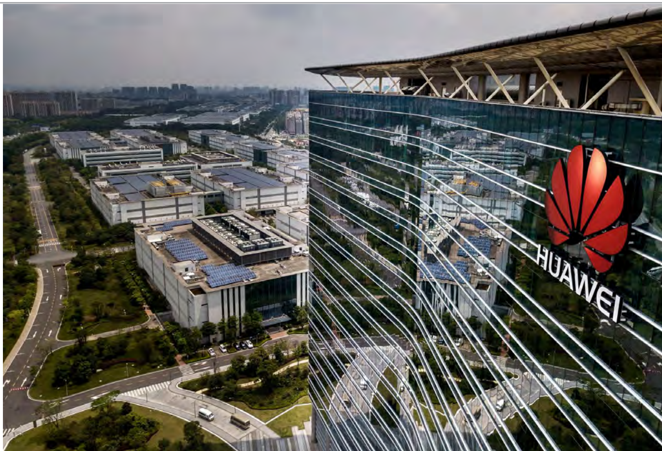
Huawei's main building in the company's production campus, near Shenzhen, China