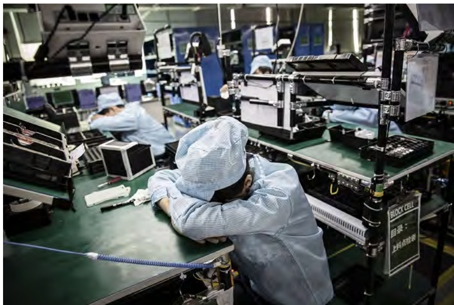
During their lunch break, workers sleep on their workbenches

In March, a group of anonymous developers created in GitHub, a platform for sharing programming