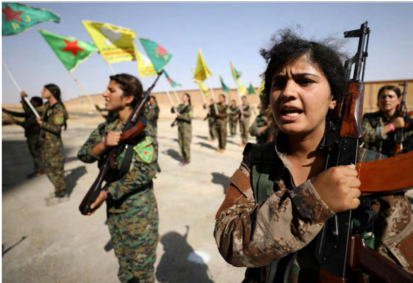
Kurdish women's militia in Syria