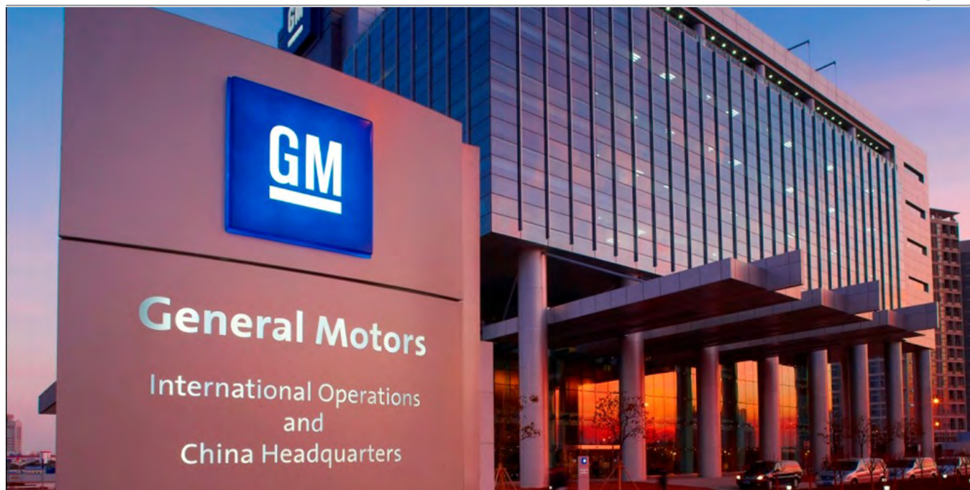
GM Headquarters in China