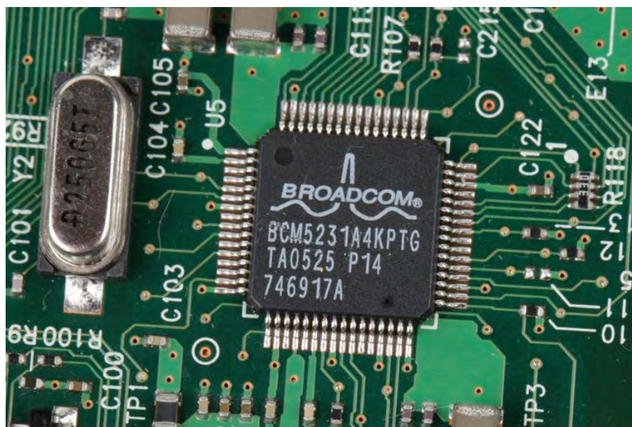
American company Broadcom supplies chips to Huawei and ZTE

Therefore, we must acknowledge that China has progressed in recent years in technological development, but it is an uneven development since it cannot reach the same level as the United States. It has also taken steps in cyberspace or robotics but, as a whole, it is far behind the United States.